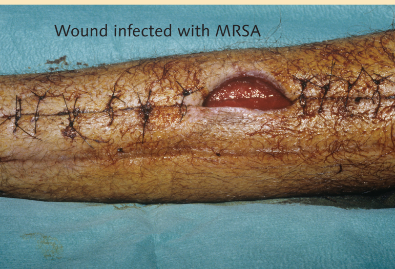
Wound infected with MRSA

Because MRSA is so widespread in our hospitals, prevention and treatment with flucloxacillin is now not effective. We are now dependent on the last reliable antibiotic class, vancomycin. This drug does not work as well, is more expensive, has side effects and has to be administered in hospital. Even with treatment 25% of patients that develop MRSA bacteraemia will die. This equates to approximately 2000 people each year. The UK has one of the highest rates of MRSA infection in Europe, but it is not as high as in the USA. Very recently, new antibiotics have been introduced to fight MRSA. However, they are all very expensive, and it is likely resistance will develop to them quickly, so they are often kept in reserve and not widely used. This makes it uneconomical for pharmaceutical companies to develop new drugs.