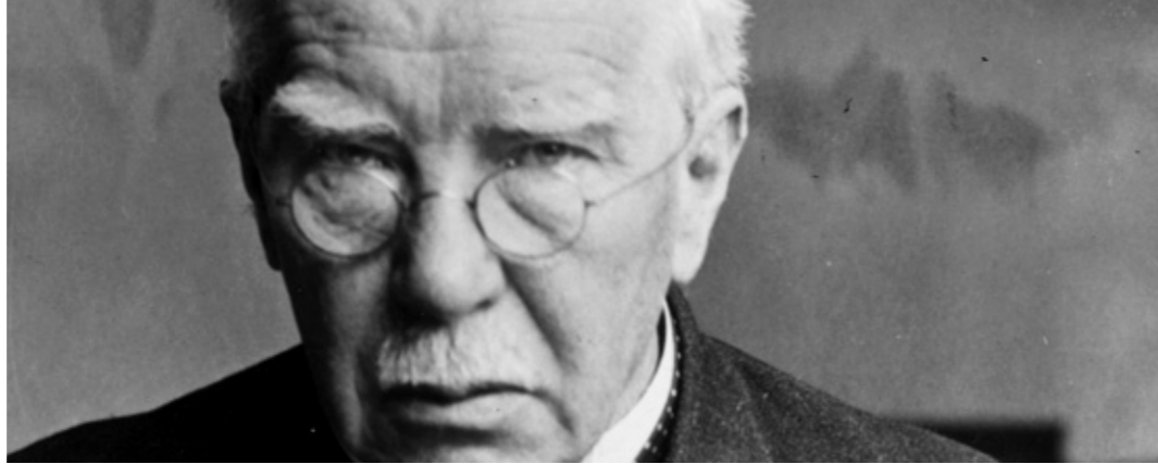
◀ Almroth Wright, October 1929.