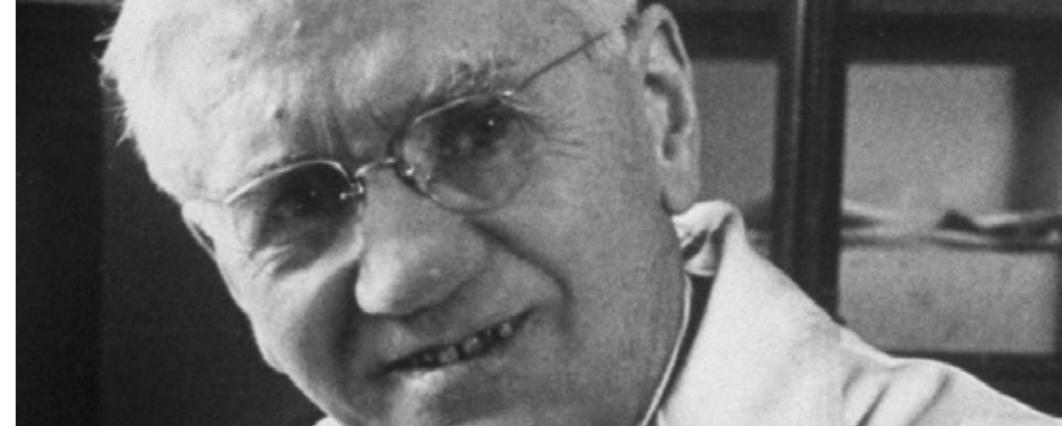
▶ Alexander Fleming, December 1951.

original thinker, he was a deft, and became a very experienced, bench worker. Over a period of 36 years in Wright's department he turned out a series of important contributions to laboratory medicine. The semi-protected environment of the crowded Paddington laboratory well suited this perceptive but reserved man, whose abilities were complementary to those of his extrovert chief. Fleming also owed something to his friend and contemporary, Charles Wilson, later Lord Moran. It was Moran, the consummate medical politician who, in lifting St Mary's from its Cinderella status among the London medical schools, promoted Fleming's reputation.