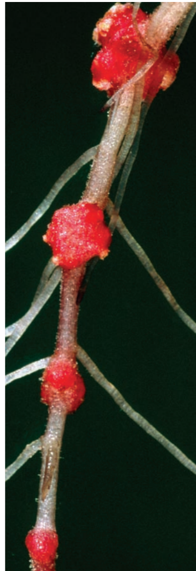
▲ Red nitrogen-fixing nodules on the roots of a black alder tree ( Alnus glutinosa ). The nodules contain symbiotic Frankia sp. bacteria, which take nitrogen from the air and convert it into forms the tree can use for nutrition. In return, the bacteria feed on sugars produced by the tree. This symbiosis means that the alder can grow in less fertile soils than many other plants.

Nitrogen gas can be fixed in three ways. 1. Atmospheric fixation. This occurs spontaneously by lightning; a small